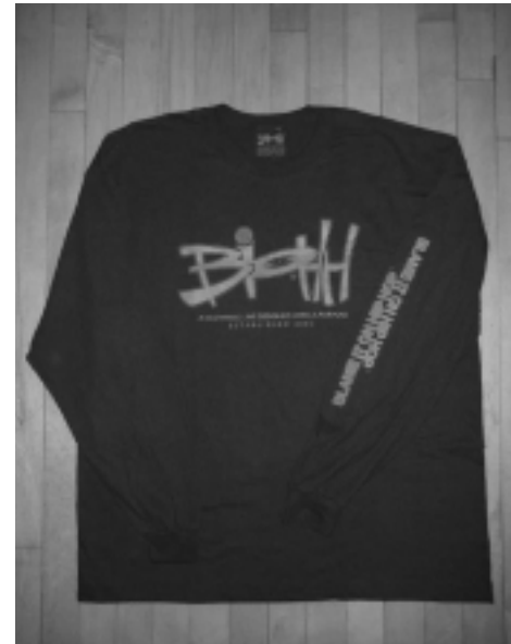
One of the Blame It On Hip-Hop shirt designs.

As far as business objectives, BIOHH's plans for its local impact are diverse and much needed in this